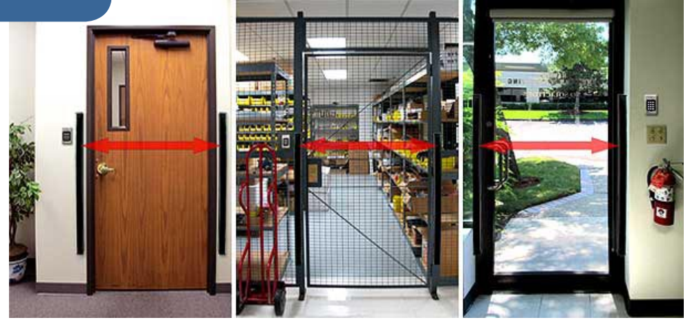
The T-DAR Entry Vision Model EV100 attach easily to a standard metal door frame or to the wall. The system is adaptable to most common settings: restricted office areas, parts storage and exterior doors.

The T-DAR Entry Vision Model EV100 consists of two modules of similar appearance: the Detector module and the Emitter module.