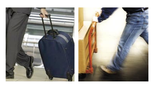
The T-DAR Entry Vision anti-tailgating detection system identifies violations but ignores carts and luggage.

Newton systems are deployed world-wide at airports, government buildings, data centers, research laboratories, financial concerns, power plants, manufacturing sites, unmanned immigration and virtually every other category of secure areas.