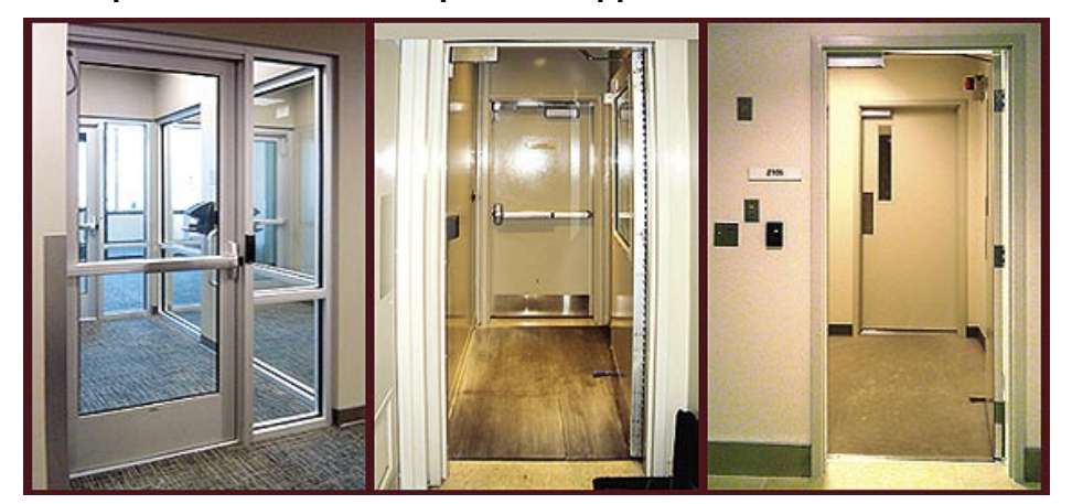
New construction of two, sideby-side portals using T-DAR Mantrap Shield systems.